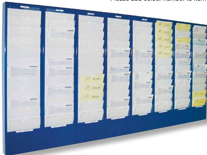
Application sample: order organisation for 8 employees with daily division for a period of 2 weeks.

for stagger plate label holder, L = 50 mm, H = 20 mm perforated every 10 mm, 50 labels = 1 sheet Colours: white (02), yellow (04), red (07), blue (12), green (14) Item No.: 84 81 7* *Please add colour number to item no.